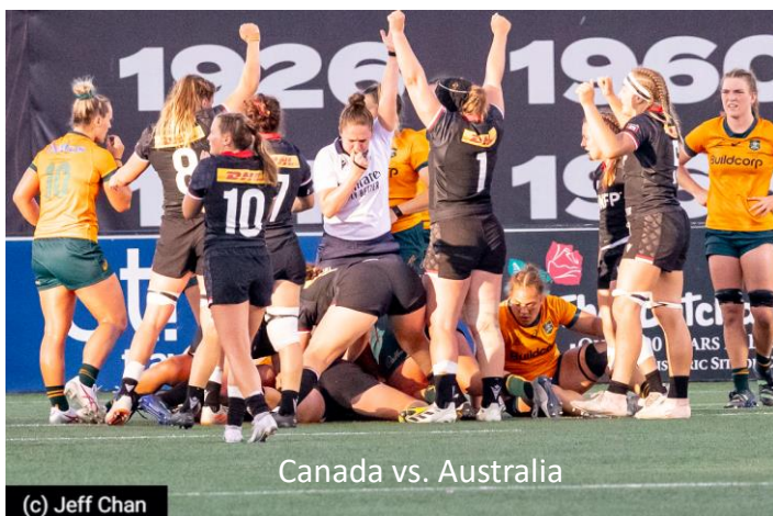
Canada vs. Australia

The World Rugby Pacific Four 2023 Series wound up its Ottawa leg with a disappointing 52-21 loss to New Zealand and a dominant 45-7 victory over Australia at TD Place, to go with a previous win over the USA in Spain. The New Zealand game, with an attendance of 10,092, set a record for the largest audience for a women's rugby game in Canada. Canada finished with a 2-1 record, cementing a second-place finish, and qualification for the inaugural WXV series over the next two years.