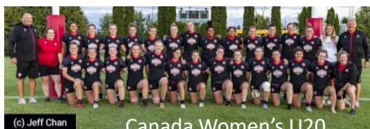
Canada Women's U20

The Pacific Four series was an opportunity for Canada's Women's U20 team (photo below) and Women's U18 East 40-person roster to gather in Ottawa. The U20 team – coming together for the first time since before pre-pandemic days – were defeated by both the USA and Wales U20 teams and the considerably older U Ottawa Gee Gees women's rugby team. The Women's U23 team defeated the USA on July 26, and plays them again on July 30 in Quincy outside Boston.