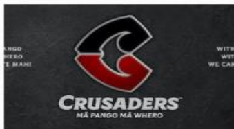
8 University Men’s Rugby Coaches Now Selected for Advanced Coaching Courses in New Zealand and Wales