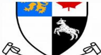
Announcing the new Aurora Barbarians RFC Development Fund